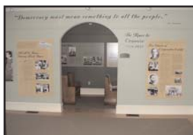
First Floor Exhibit